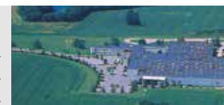
Høje Taastrup, Denmark