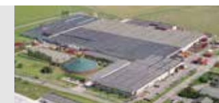
Nørre Alslev, Denmark