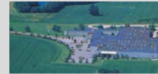
Høje Taastrup, Denmark