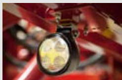
Night Spraying Light

Since 1957 HARDI has committed to the ever-increasing demands for efficient and precise plant protection. HARDI is the trendsetter within application of crop protection products. To achieve this position continued developments and innovation are essential. HARDI is committed to the long term future of plant protection.