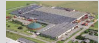
Nørre Alslev, Denmark