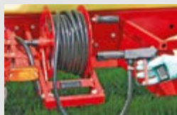
External Cleaning Kit